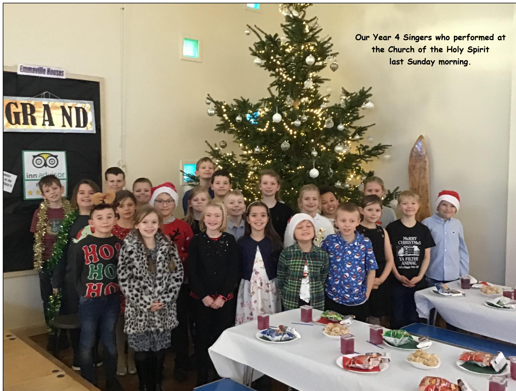
Our Year 4 Singers who performed at the Church of the Holy Spirit last Sunday morning.