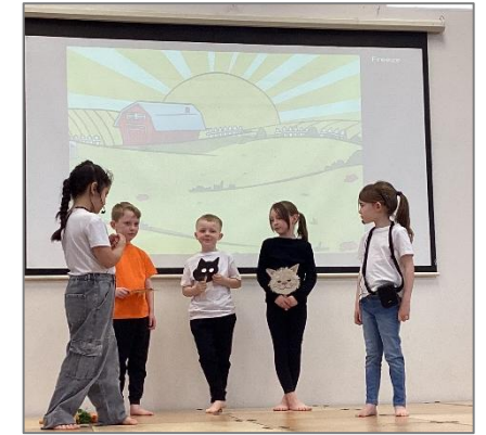
Year 1 wowed us with their Eggeptional Easter performance