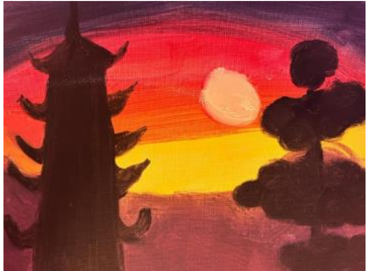
Japanese Sunset By Chloe (Northern Europe)