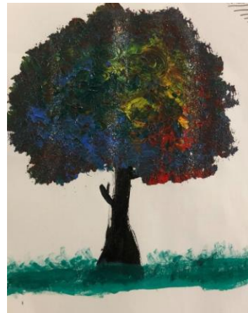
Nature By Alayah (Asia)