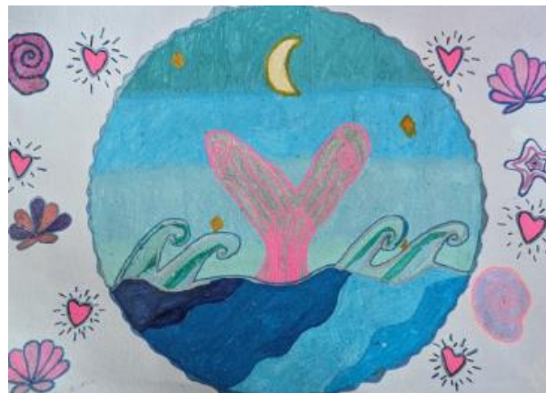
Ocean Dream By Caro (Antarctica)