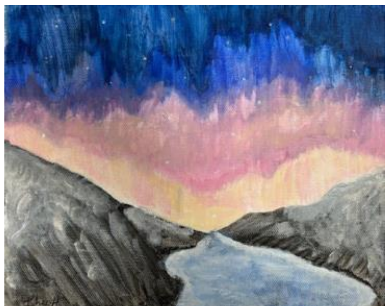
Glacier Skies By Theo (North America)