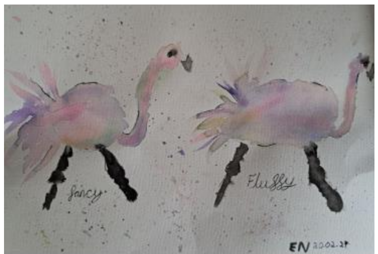
Fancy and Fluffy By Eva (Africa)